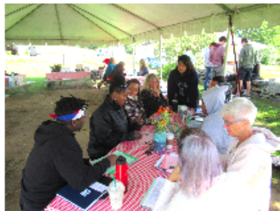
At the Farm School, August Staff Retreat

Mission Hill was founded on and for the work of the collective. Deborah Meier, our founder, is a firm believer in the power of collective minds, working together for the common good of students and families. It was her belief in democratically run schools that led to the creation of Central Park East, Central Park East II, River East (all in East Harlem, NYC) and Mission Hill School. Deborah says, "You can not prepare kids for a democracy unless they experience living in a democracy." Democracy is the foundation of our community and our collective work is how we live out that democracy every day.