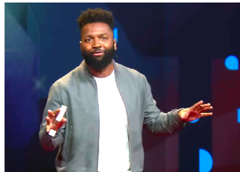
Screenshot of Baratunde Thurston's TEDTalk on YouTube

To further our work toward becoming an antiracist institution, we watched and discussed the TEDtalk How to deconstruct racism one headline at a time by Baratunde Thurston. I encourage you to Google this video and watch it. Baratunde weaves personal stories, humor, grammar rules, historical facts and current media to highlight the white supremacy in which we are all operating. “There is a structure to white supremacy, as there is to misogyny, as there is to all systemic abuses of power. Structure is what makes them systemic. I am asking people to see the structure.